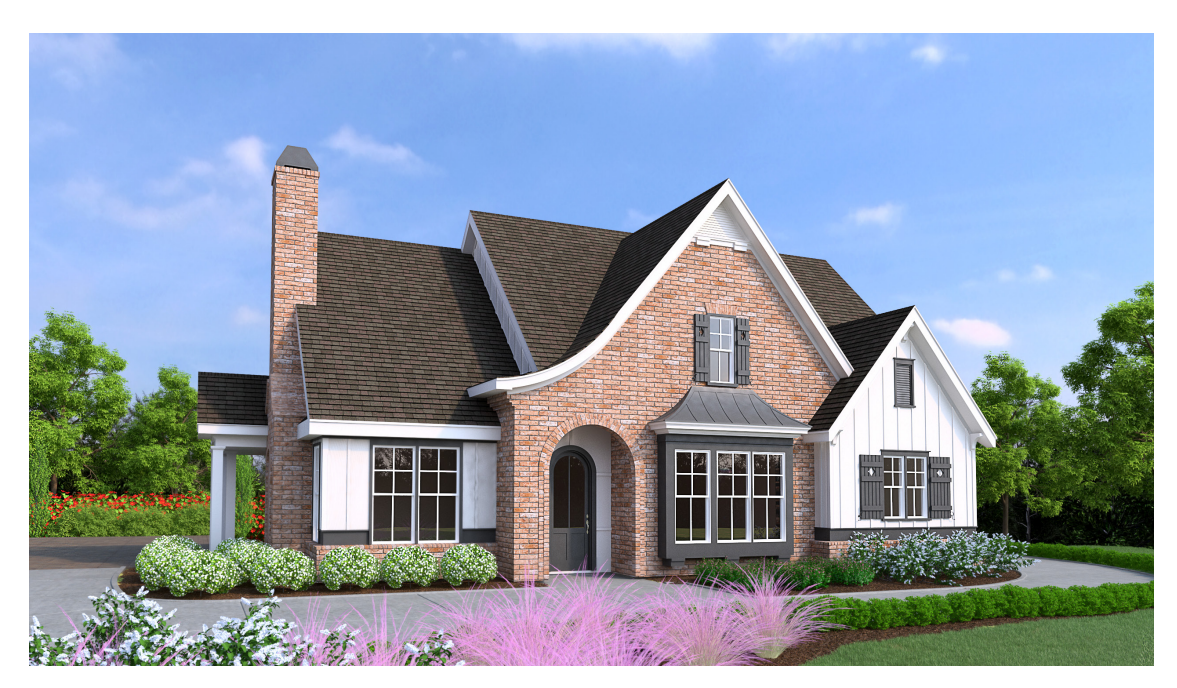
THE OWENBY CLUBHOUSE